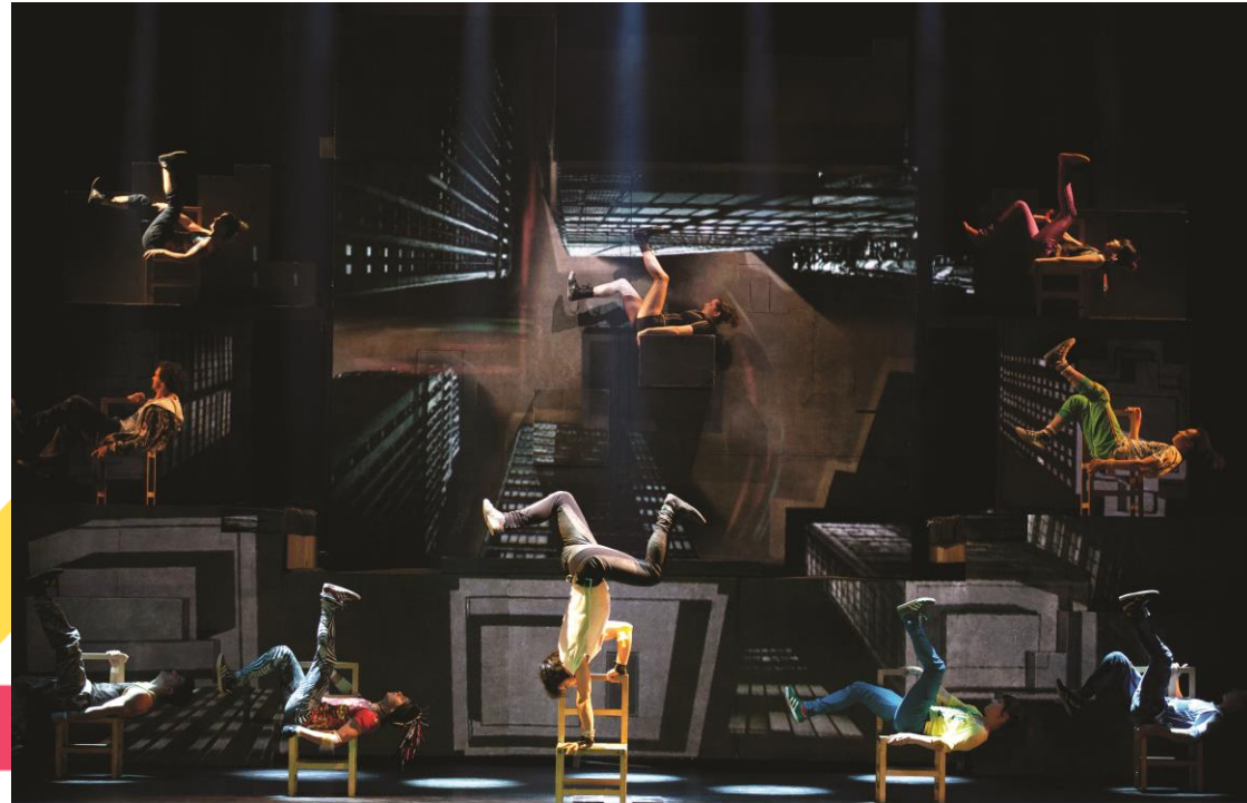
CIRQUE ÉLOIZE / iD

A high-energy blend of circus arts and urban dance, a production for the young-at heart featuring an inspiring soundtrack and innovative video projections. Fifteen acrobats, aerialists and breakdancers come together to create a microcosmic society where two groups celebrate everyone's distinct identity.